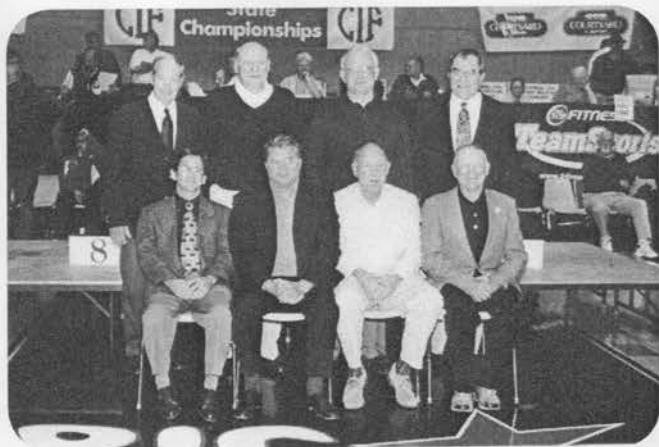
2002 California Wrestling Hall of Fame Inductees at State CIF Tournament

Wrestling builds character and is unique among sports because it welcomes all athletes regardless of physical characteristics, race, socioeconomic status or geography. The California Wrestling Hall of Fame shall recognize and honor into perpetuity those wrestlers, coaches, officials, friends of wrestling and related organizations who, by their exemplary contributions, are worthy of recognition by induction into the California Hall of Fame.