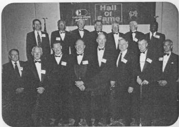
Inductees of 2001 California Wrestling Hall of Fame Banquet, May 25, 2001