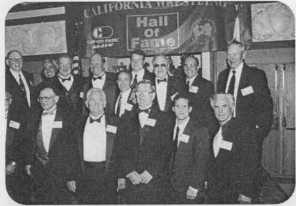
Inductees of 2000 California Wrestling Hall of Fame Banquet, May 27, 2000

Degree. He started his coaching career at Cal Poly in 1948 as a football and wrestling coach. In 14 seasons his wrestling teams had a record of 48-10. His most accomplished team was in 1957-58. Undefeated at 17-0 and P.C.I. Champions, he put Cal Poly on the wrestling map. He started the Cal Poly J.C. and high school tournaments in 1950 and was instrumental in starting wrestling programs at four central coast high schools. He trained teachers, coaches and officials until retiring in 1987.