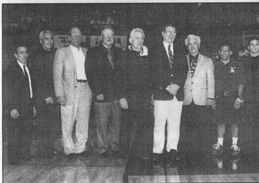
Nine of our Inductees Recognized at the California C.I.F. Wrestling Tournament